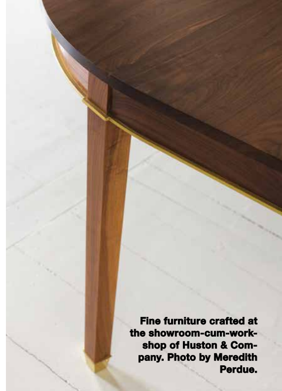
Fine furniture crafted at the showroom-cum-workshop of Huston & Company.