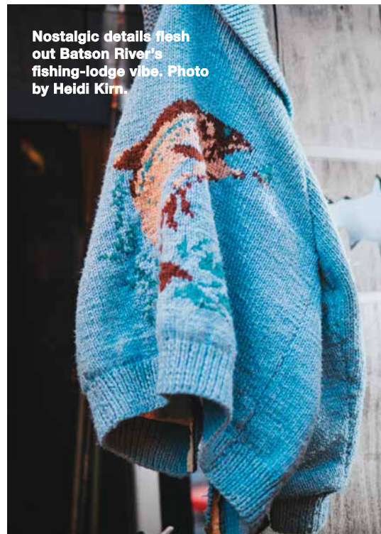
Nostalgic details flesh out Batson River's fishing-lodge vibe.