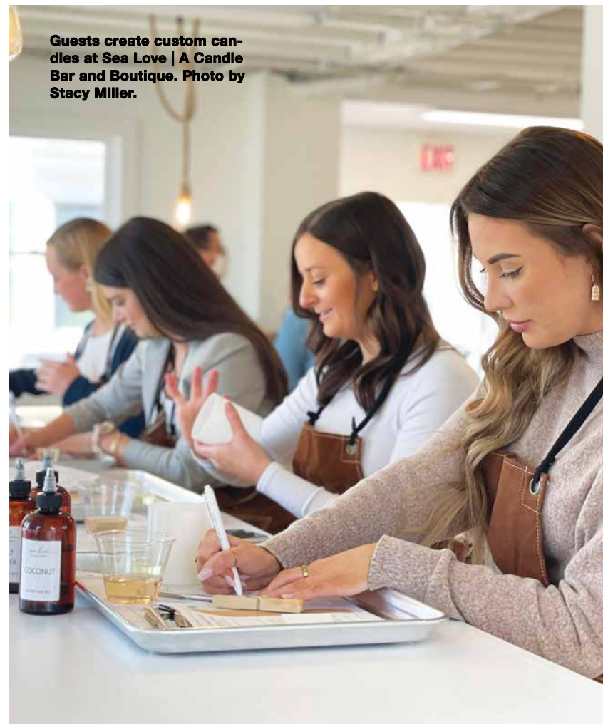
Guests create custom candles at Sea Love | A Candle Bar and Boutique.