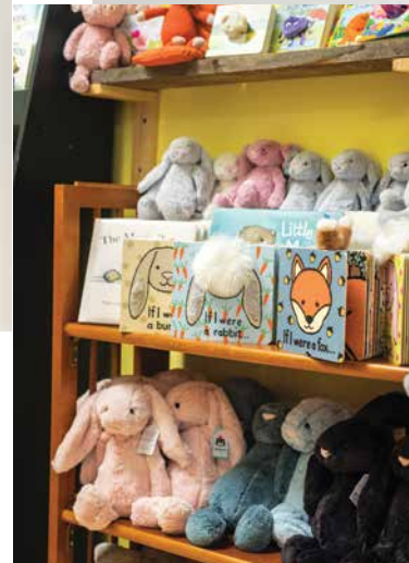
above Kennebunk Toy Co. carries just about any gift a kid could want this holiday season. right Dock Square Emporium stocks local creations meant to induce relaxation and nostalgia.