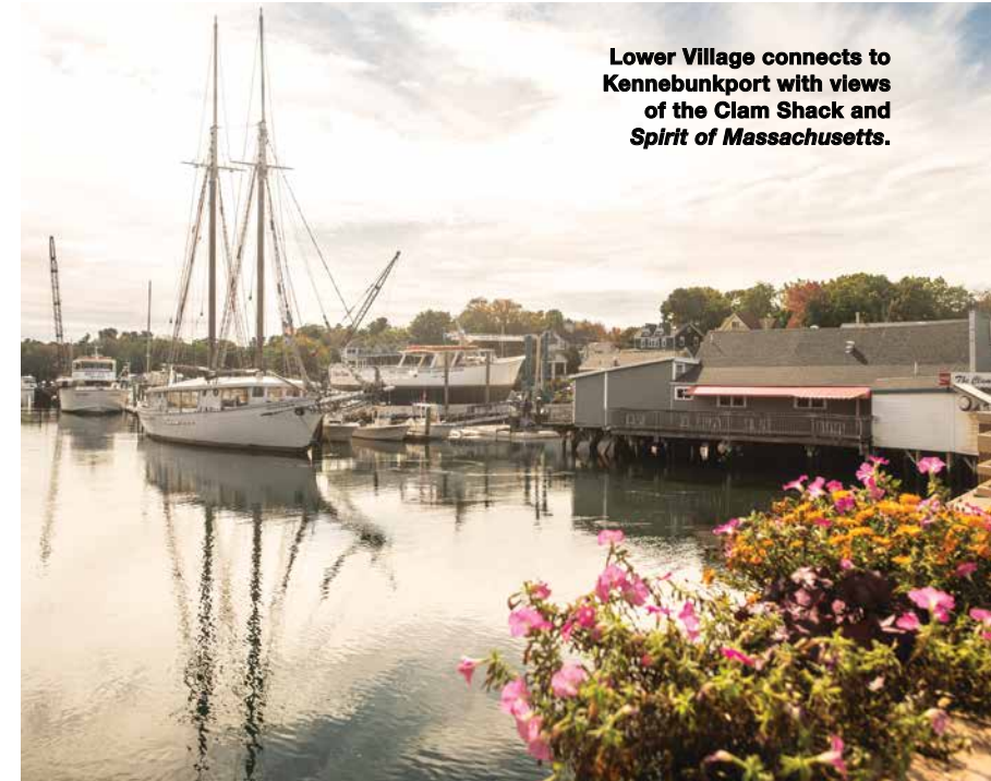
Lower Village connects to Kennebunkport with views of the Clam Shack and Spirit of Massachusetts.