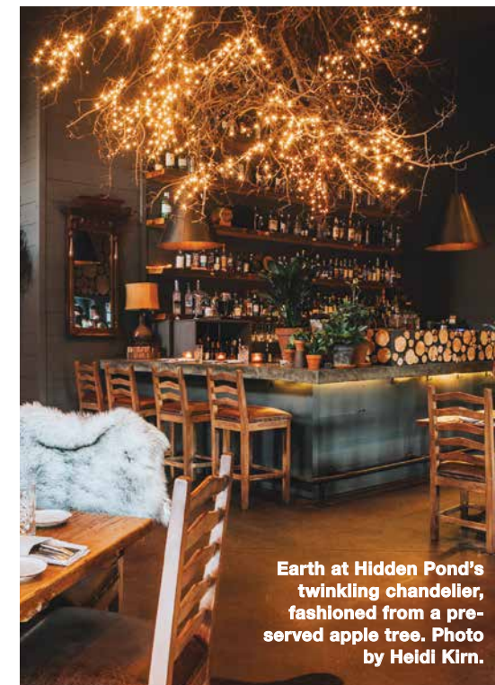
Earth at Hidden Pond’s twinkling chandelier, fashioned from a preserved apple tree.