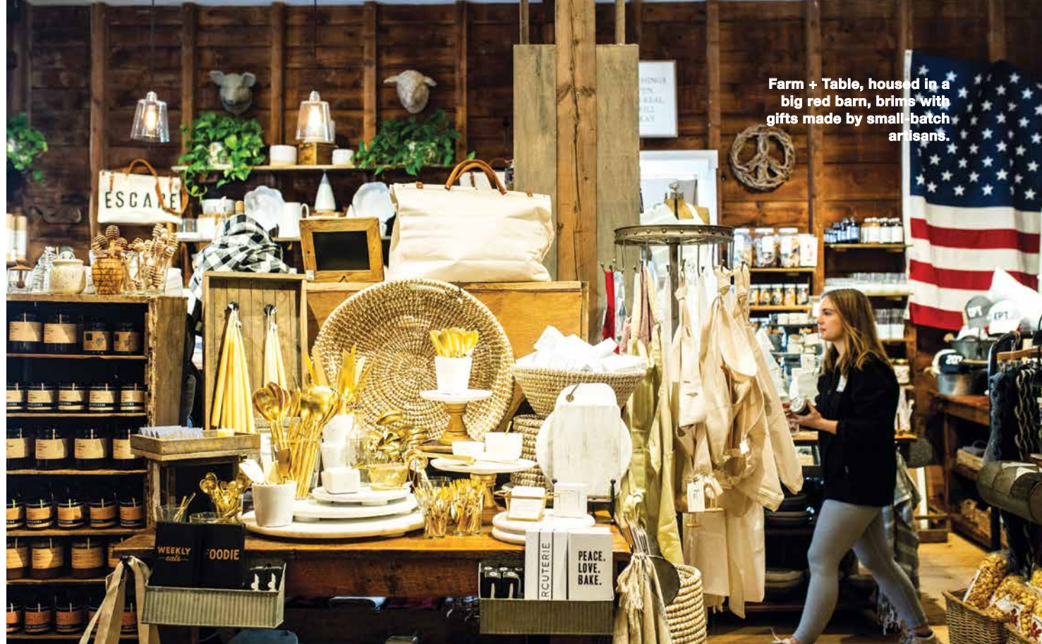
Farm + Table, housed in a big red barn, brims with gifts made by small batch artisans.