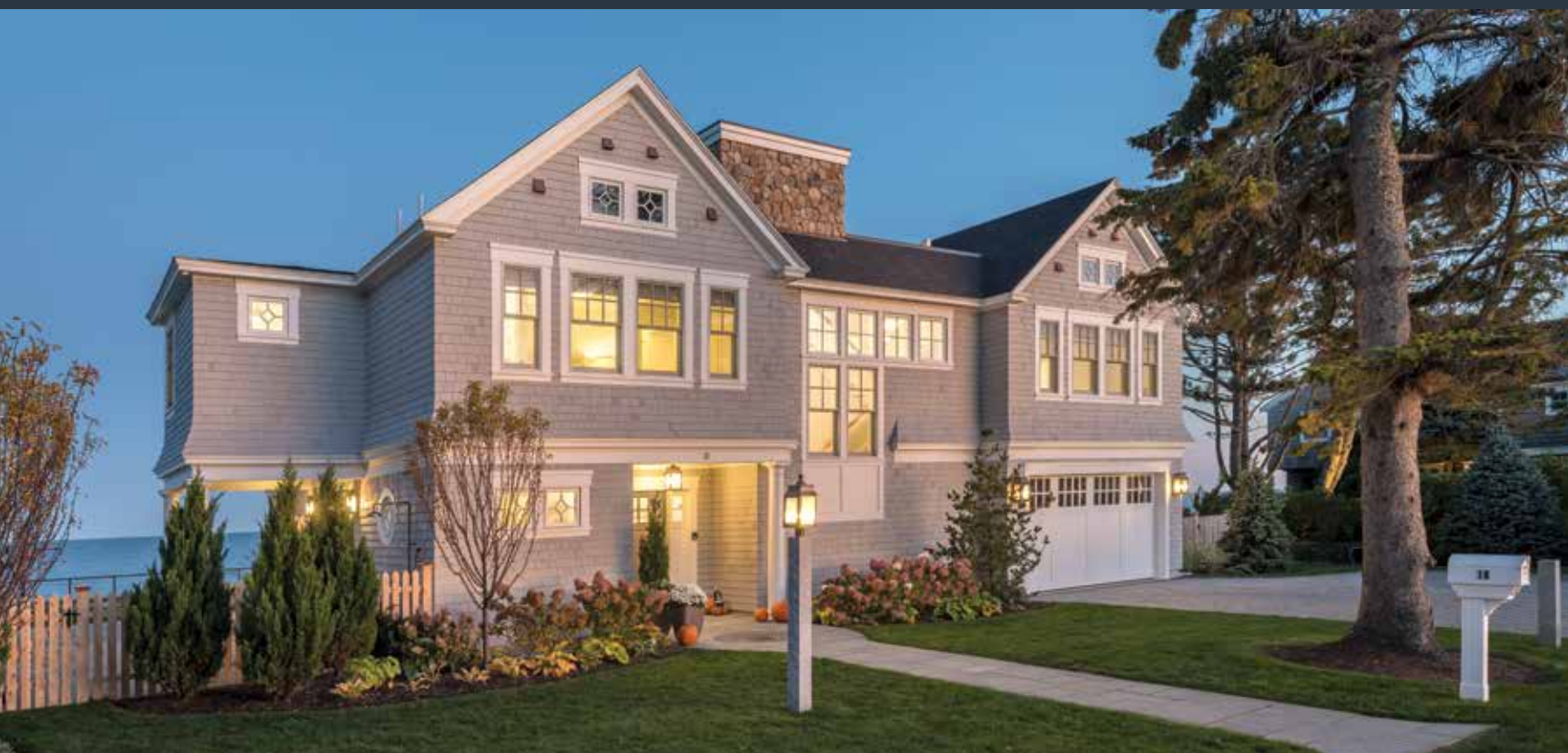
(Clockwise from top) The serene owners' bedroom is painted in Sherwin-Williams's Rarified Air. On the exterior, Freedman manipulated subtle details, such as the scale and placement of trim and the depth of the roof in order to bring down the scale of the facade and create interesting shadows. Designing with a tight buildable envelope was a challenge, so Freedman used every inch available to maximize the views.